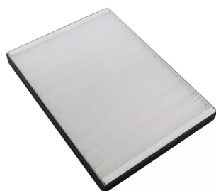
Main filter 283x206x25mm for FilterCase Basic