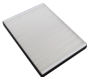
Main filter 283x206x25mm for FilterCase Basic