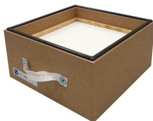
HEPA filter H14, 610x610x292 mm Product No.: 50202146629