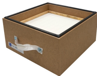
HEPA filter H14, 610x610x292 mm Product No.: 50202146629