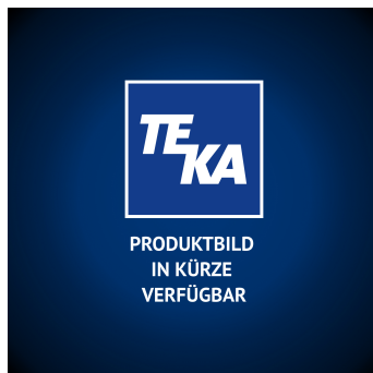
Adapter for FilterCube 4 of diam. 500 mm Product No.: 9501441940111