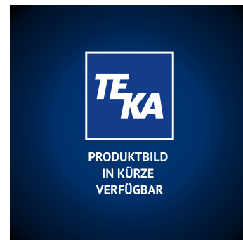
Extension set H13 filter for FilterCube 4 Product No.: 4000950144002