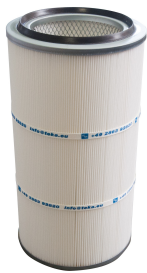
Filter cartridge, type standard, Product No.: 6160600110008