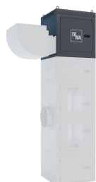
Option soundproof housing for FilterCube 4