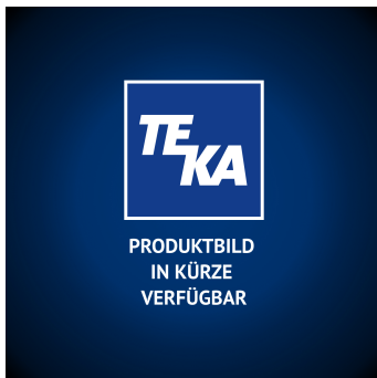
Security upgrade for FilterCube, AirTech P10 and