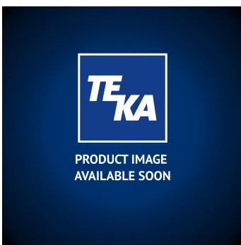
Extension set H13 filter for FilterCube 4 Product No.: 4000950144002