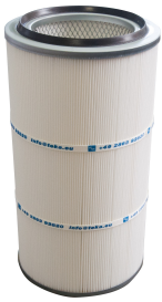
Filter cartridge, filter area 7,8m 2 Product No.: 6160600107808