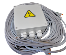
Master slave junction box for controlling a motor Product No.: 15001001604