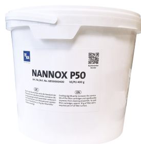
Cartridge protection NANOX P50 Product No.: 68130000400