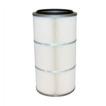
Filter cartridge, Type easy clean nano Product No.: 6160600312606