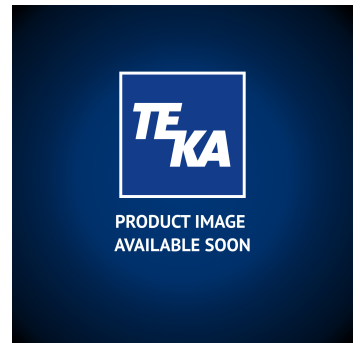
Adapter for FilterCube 4 of diam. 500 mm Product No.: 9501441940111