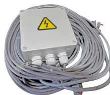
Mater-Slave-Control 16A (incl. Transf. for 24V AC) Product No.: 15001001602