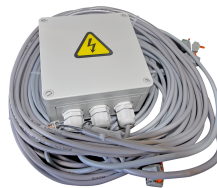
Start-Stop Automatic Product No.: 150010016