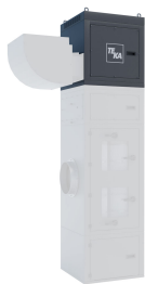
Option soundproof housing for FilterCube 4 Product No.: 950144194712