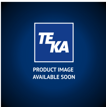
Frequency converter with pressure transmitter for Product No.: 962002009030