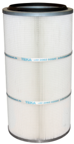
Filter cartridge, type easy clean plus Product No.: 6160600212508