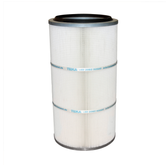
Filter cartridge, Type easy clean nano Product No.: 6160600307706