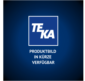
Extension set H13 filter for FilterCube 4 Product No.: 4000950144002