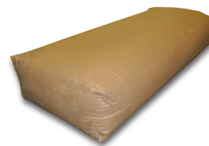
Cartridge protection NANOX P50 Product No.: 68130010000