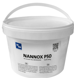
Cartridge protection NANOX P50 Product No.: 68130000100