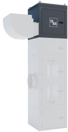
Option soundproof housing for FilterCube 4