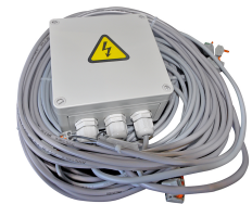
Master-Slave-Control 32A(incl. Transf. for 24V AC) Product No.: 150010032