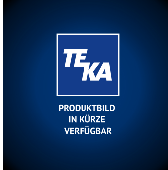
Adapter for FilterCube 4 of diam. 500 mm Product No.: 9501441940111