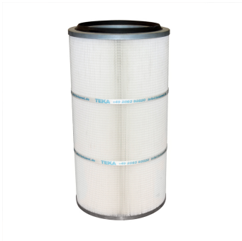
Filter cartridge, Type easy clean + Product No.: 6160600207706