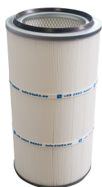
Filter cartridge, filter area 7,8m² Product No.: 6160600107808