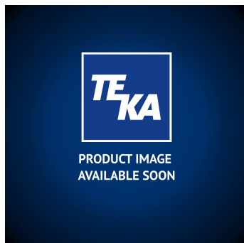
Macrofalt filter G3, 62x62x48mm, Product No.: 100350008