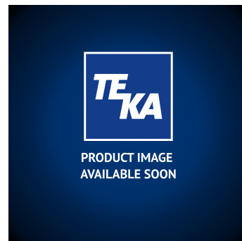
Spare filter mat for Rittal-exhaust fan Product No.: 5020007079