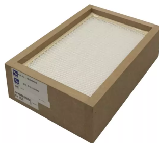
Hepa filter H13, size 337 x 230 x 100 mm Product No.: 100350004