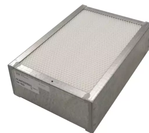
Ulpa filter U16, size 337 x 230 x 100 mm Product No.: 100350005 (Page: 3 for product 9731030201524)