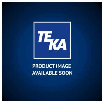
Activated carbon 7,5 kg for LFE unit Product No.: 100197310