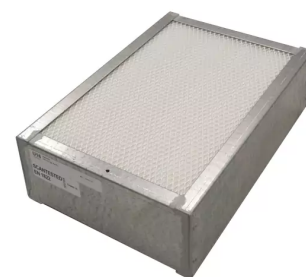
Ulpa filter U16, size 337 x 230 x 100 mm Product No.: 100350005