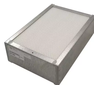
Ulpa filter U16, size 337 x 230 x 100 mm Product No.: 100350005 (Page: 3 for product 9731030201524)