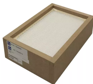
Hepa filter H13, size 337 x 230 x 100 mm Product No.: 100350004