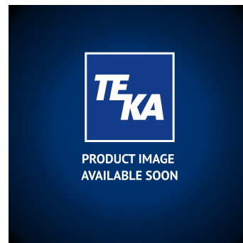
Spare filter mat for Rittal-exhaust fan Product No.: 5020007079