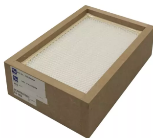
Hepa filter H13, size 337 x 230 x 100 mm Product No.: 100350004