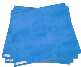
Gross filter set for filtoo, ViroLine and AirToo Product No.: 978003