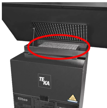
Extension set for working surface filtoo Product No.: 978018