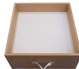
Main filter for filtoo and AirToo Product No.: 978005