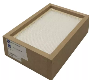
Hepa filter H13, size 337 x 230 x 100 mm Product No.: 100350004