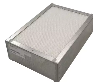
Ulpa filter U16, size 337 x 230 x 100 mm Product No.: 100350005