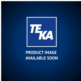
Activated carbon 7,5 kg for LFE unit Product No.: 100197310