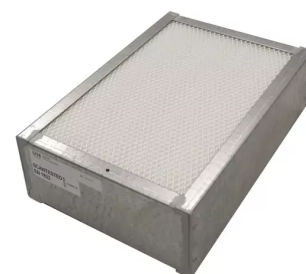
Ulpa filter U16, size 337 x 230 x 100 mm Product No.: 100350005