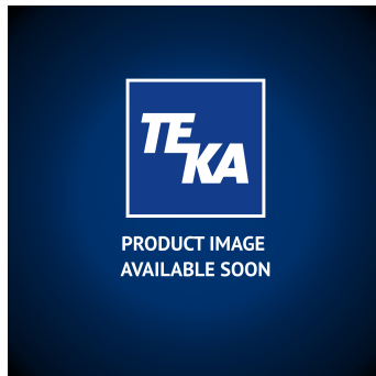
Macrofalt filter G3, 62x62x48mm, Product No.: 100350008