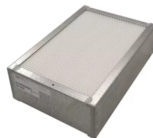
Ulpa filter U16, size 337 x 230 x 100 mm Product No.: 100350005