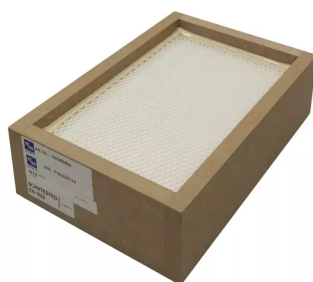
Hepa filter H13, size 337 x 230 x 100 mm Product No.: 100350004