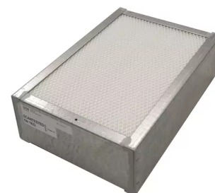
Ulpa filter U16, size 337 x 230 x 100 mm Product No.: 100350005