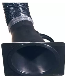
Adapter for extraction hood; diam.: 150 Product No.: 66210