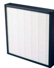
Pre filter for filtoo, ViroLine and AirToo Product No.: 978004