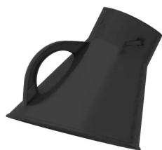
Exhaust ventilation hood diam. 150 mm Product No.: 66200