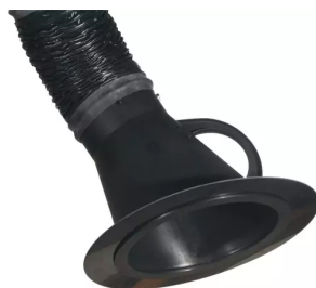
Adapter for extraction hood; diam 150 mm, Product No.: 66220