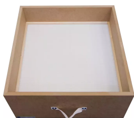
Main filter for filtoo and AirToo Product No.: 978005