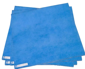
Gross filter set for filtoo, ViroLine and AirToo Product No.: 978003