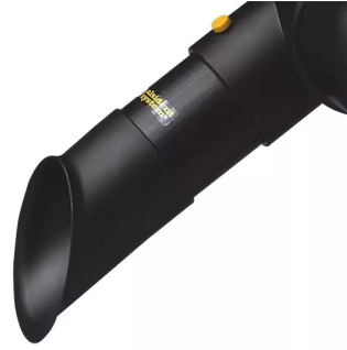
Extractor tube, anodised alu, diam. 75, antistatic Product No.: 175256