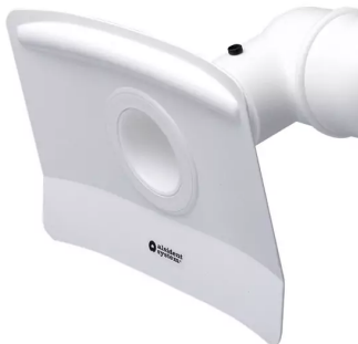
ALSIDENT flat suction bonnet, NW 100, 420 x 280 mm Product No.: 1100422875