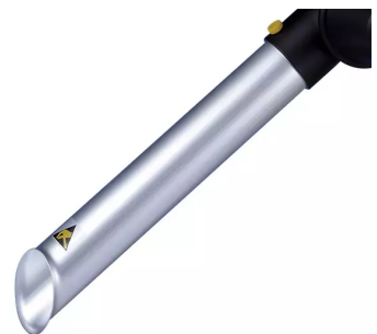
ALSIDENT pipe nozzle NW 50 (AS), antistatic, Product No.: 150316