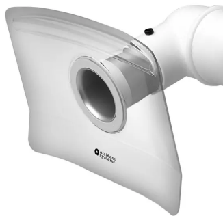
ALSIDENT Suction hood, DN 100, 420 x 280 mm