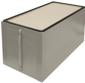
Hepa storage filter 610x305x292 mm Product No.: 1003502