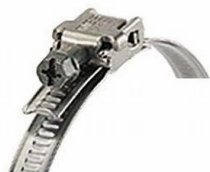
Hose clip, dia. 100 mm Product No.: 51184