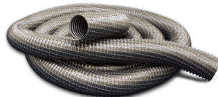
High vacuum hose, diameter 100 mm Product No.: 511040025