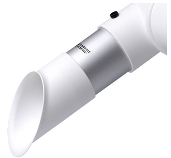
Extractor tube, white, length 250mm Product No.: 175265