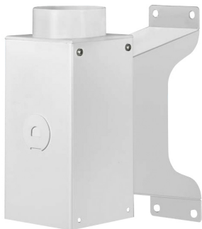
U-profile System 100 Product No.: 2195