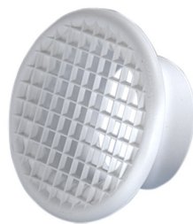
Protective nettings; System 75 Product No.: 5177