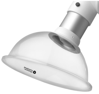
Suction hood; white, diam 280 mm Product No.: 175285