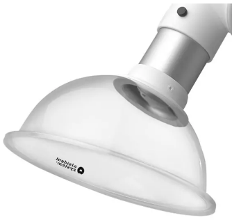
Suction hood; white, diam 280 mm Product No.: 175285