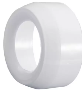
ALSIDENT Reducer 100 mm - 75 mm, white Product No.: 410075