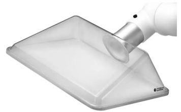
ALSIDENT Suction hood, DN 75, 420 x 320 mm Product No.: 17542325