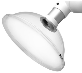
Suction hood, white, Product No.: 175355