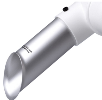
Extractor tube, anodised alu, diam. 75 Product No.: 17525