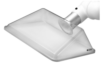
ALSIDENT Suction hood, DN 75, 420 x 320 mm Product No.: 17542325