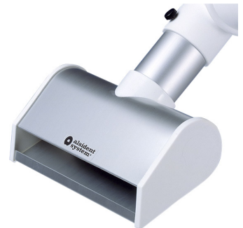
Slit-suction nozzle length 250 mm size 75, Product No.: 175255