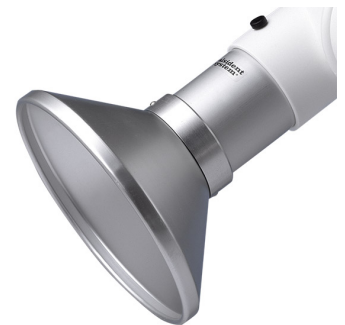
Suction hood; Diam 200 mm, white Product No.: 17524