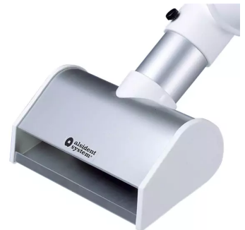
Slit-suction nozzle length 250 mm size 75, Product No.: 175255