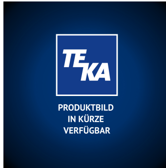
Adapter for FilterCube 4 of diam. 500 mm Product No.: 9501441940111