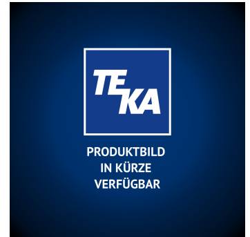
Extension set H13 filter for FilterCube 4 Product No.: 4000950144002