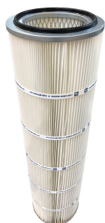
Filter cartridge, filter area 20m 2 Product No.: 6161200120008