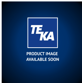
Frequency converter with pressure transmitter for Product No.: 962002009055