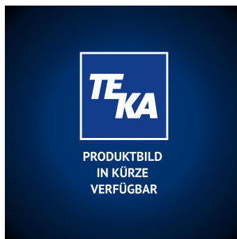
Adapter for FilterCube 4 of diam. 500 mm Product No.: 9501441940111