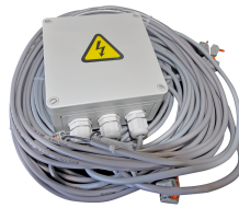
Mater-Slave-Control 16A (incl. Transf. for 24V AC) Product No.: 15001001602