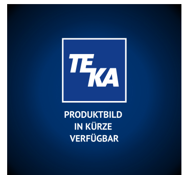
Extension set H13 filter for FilterCube 4 Product No.: 4000950144002