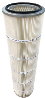
Filter cartridge, filter area 15,6m² Product No.: 6161200115608