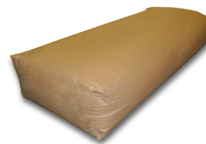
Cartridge protection NANNOX P50 Product No.: 68130010000