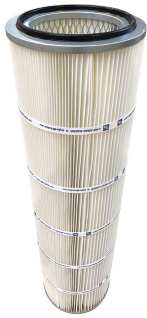
Filter cartridge, filter area 15,6m 2 Product No.: 6161200115608