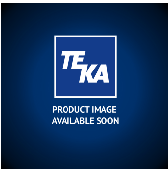
Adapter for FilterCube 4 of diam. 500 mm Product No.: 9501441940111