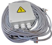
Master-Slave-Control 32A(incl. Transf. for 24V AC) Product No.: 150010032