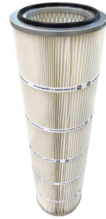
Filter cartridge, Type easy clean nano Product No.: 6161200315606