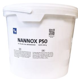
Cartridge protection NANNOX P50 Product No.: 68130000400