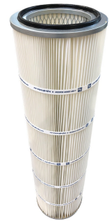
Filter cartridge, Typ easy clean plus Product No.: 6161200215606