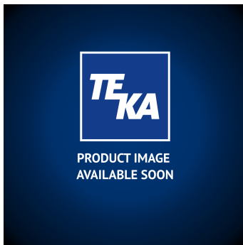
Extension set Hepa filter (H13) Product No.: 4000950144002