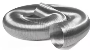
Exhaust air hose, diam. 160mm