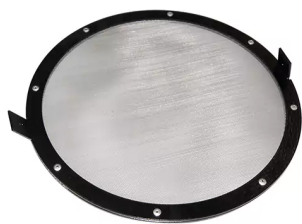
Protection grille (finely woven) for installation