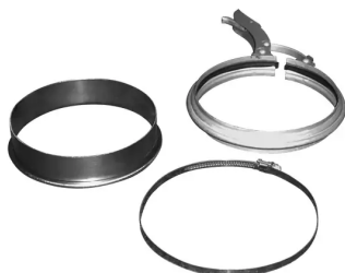
Connecting materials diam. 160 mm Product No.: 96301