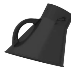
Exhaust ventilation hood for suction arm diam. 150 Product No.: 662000003