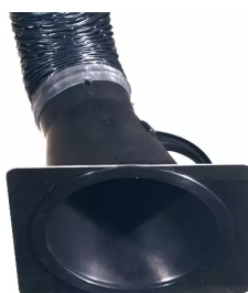
Adapter for extraction hood; diam.: 150