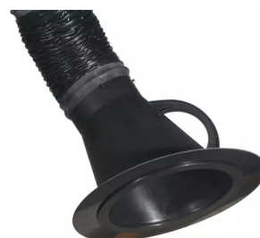
Adapter for extraction hood; diam 150 mm,