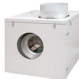
Sound proofing box Product No.: 960301