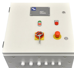
Star-delta switch, 11 kW, 400V Product No.: 9620020