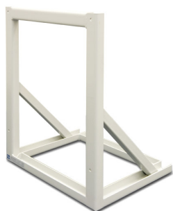
Wall bracket for TEKA fan 5,5 - 11 kW Product No.: 96020