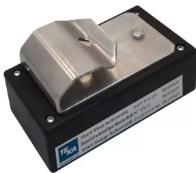
Start Stop Automatic / Incl. magnetic field sensor Product No.: 963131220123