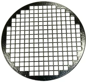
Guard, diam.160mm Product No.: 41501