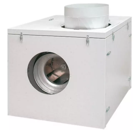
Sound proofing box Product No.: 960101