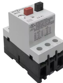
Protective motor switch Product No.: 9620103