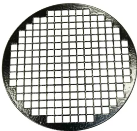
Guard, diam.160mm Product No.: 41501