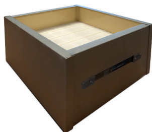
Replacement combi-filter for AirFilter Mini Product No.: 10031941