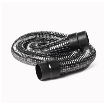
Suction hose with two connectors Product No.: 9631925