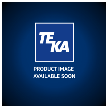
Outlet spigot for LMD 507/508/504/501 Product No.: 400094007