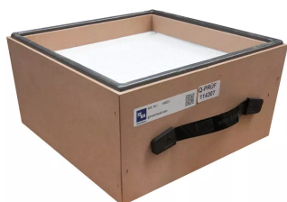
High particulate filter H13, 305x305x150 (+2*6) Product No.: 10031