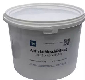
Activated carbon filling for 3,5 kg Product No.: 100197507