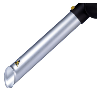
ALSIDENT pipe nozzle NW 50 (AS), antistatic, Product No.: 150316