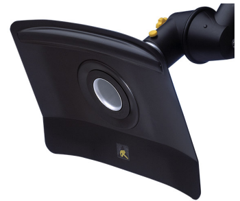
ALSIDENT Suction hood, DN 50, 330 x 240 mm Product No.: 15033246