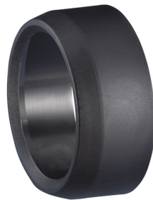
ALSIDENT Reducer 63 mm - 50 mm, black Product No.: 463506