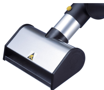
Alsident slotted nozzle DN50 mm (AS), antistatic, Product No.: 150206