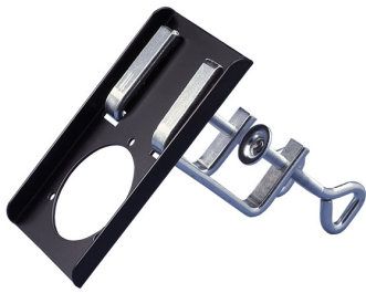
Table bracket, black, DN 50 mm Product No.: 25010050