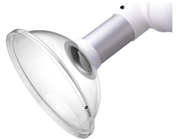
Suction hood for arm system 100 Product No.: 1100355