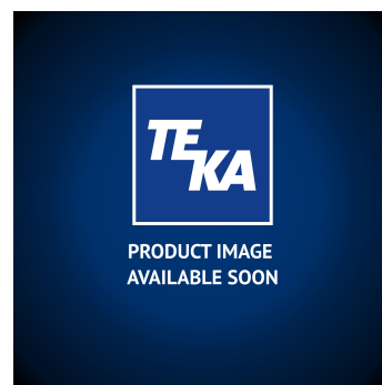
Sealing mat for dust collection bin Product No.: 95202004