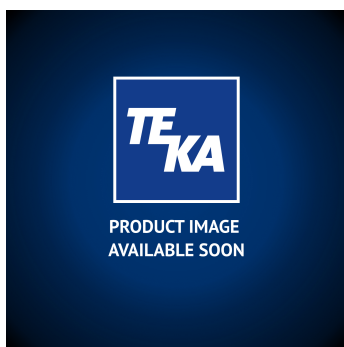
Activated carbon filter mat set (pack of 8) Product No.: 95202002