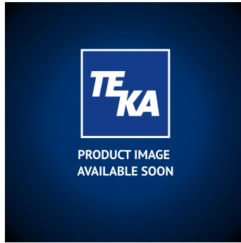
Mobile phone antenna for Airtracker Product No.: D-2017014005