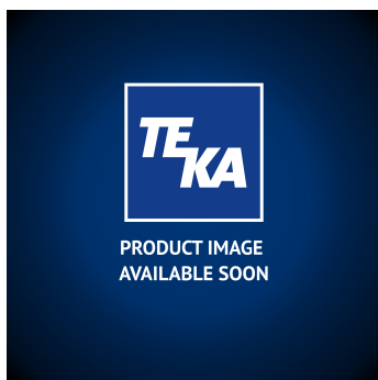
PE-bags for filter cartridge 1200mm, D=324 Product No.: 10030251702