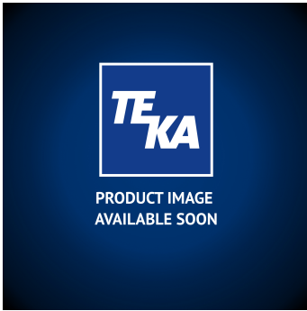
Air Quality Sensor Product No.: 2017014001