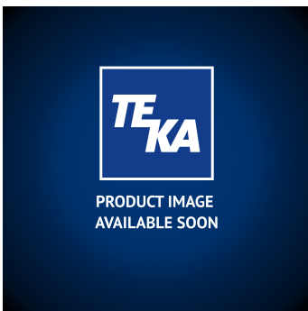
Filter cartridge, Type easy clean nano Product No.: D-95202007