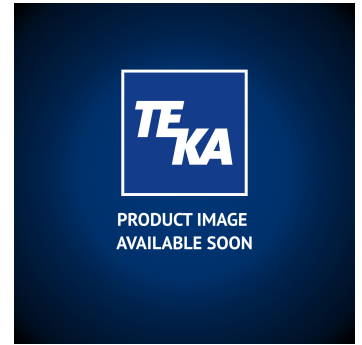
Wi-Fi antenna for AirTracker Product No.: D-2017014006