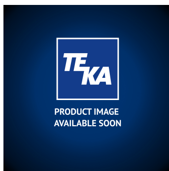
Dust collection bin incl. lid and clamping ring Product No.: 95202003