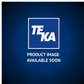
Adapter for FilterCube 4 of diam. 500 mm Product No.: 9501441940111