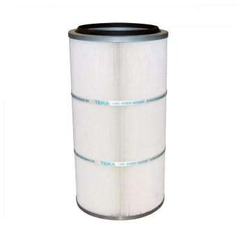
Filter cartridge, type easy clean plus Product No.: 6160600212508