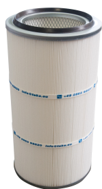
Filter cartridge, filter area 7,8m² Product No.: 6160600107808