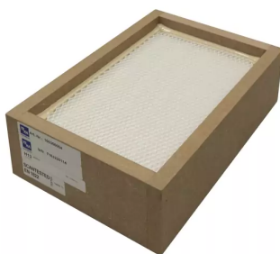
Hepa filter H13, size 337 x 230 x 100 mm Product No.: 100350004