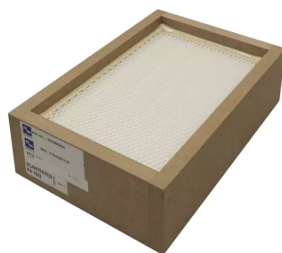
Hepa filter H13, size 337 x 230 x 100 mm Product No.: 100350004