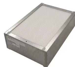
Ulpa filter U16, size 337 x 230 x 100 mm Product No.: 100350005