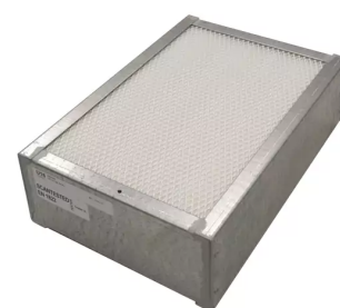
Ulpa filter U16, size 337 x 230 x 100 mm Product No.: 100350005