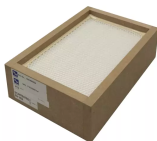
Hepa filter H13, size 337 x 230 x 100 mm Product No.: 100350004