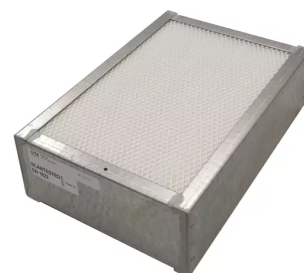
Ulpa filter U16, size 337 x 230 x 100 mm Product No.: 100350005