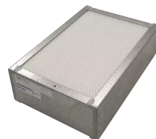
Ulpa filter U16, size 337 x 230 x 100 mm Product No.: 100350005