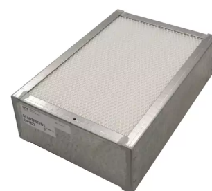
Ulpa filter U16, size 337 x 230 x 100 mm Product No.: 100350005