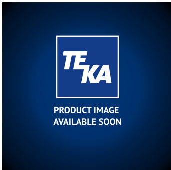
Activated carbon 7,5 kg for LFE unit Product No.: 100197310