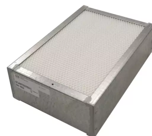
Ulpa filter U16, size 337 x 230 x 100 mm Product No.: 100350005