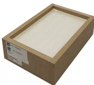
Hepa filter H13, size 337 x 230 x 100 mm Product No.: 100350004