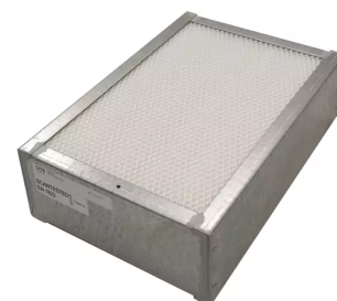
Ulpafilter U16, size 337 x 230 x 100 mm Product No.: 100350005