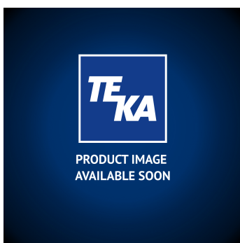
Spare filter mat for Rittal-exhaust fan Product No.: 5020007079