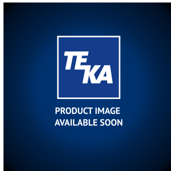
Macrofalt filter G3, 62x62x48mm, Product No.: 100350008