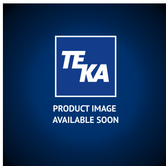
Activated carbon 7,5 kg for LFE unit Product No.: 100197310