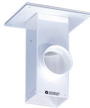
Ceiling column, white, System 50 Product No.: 225020