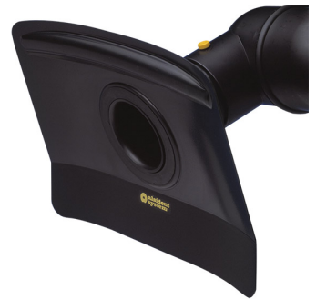
Suction hood, flat, antistatic version Product No.: 17533246