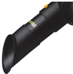
Extractor tube, anodised alu, diam. 75, antistatic Product No.: 175256