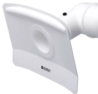
ALSIDENT flat suction bonnet, NW 100, 420 x 280 mm Product No.: 1100422875