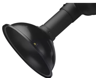
Suction hood, diam. 100 d= 385 mm Product No.: 1100356