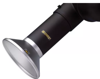
Suction hood for arm system 100 Product No.: 1100246