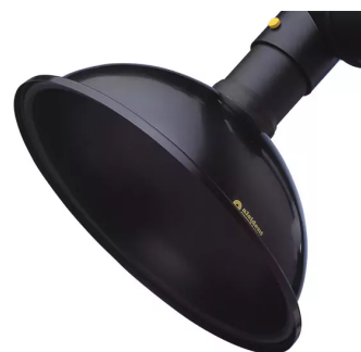
Suction hood; System 100 Product No.: 1100506