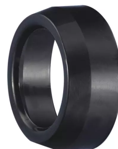
Reduction 80 mm to 50 mm Product No.: 480506