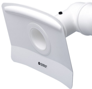
ALSIDENT flat suction bonnet, NW 100, 420 x 280 mm