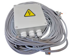
Master slave junction box for controlling a motor Product No.: 15001001604