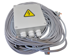
Start-Stop Automatic Product No.: 150010016