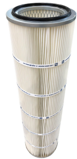
Filter cartridge, Typ easy clean plus Product No.: 6161200215606