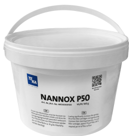
Cartridge protection NANNOX P50 Product No.: 68130000100