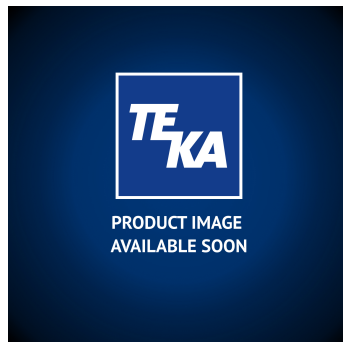
Frequency converter with pressure transmitter for Product No.: 962002009110