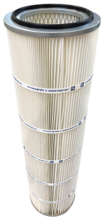
Filter cartridge, type easy clean plus Product No.: 6161200225308