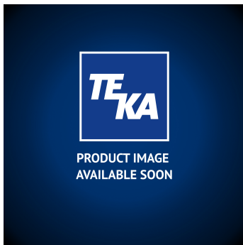
Extension set H13 filter for FilterCube 4 Product No.: 4000950144002