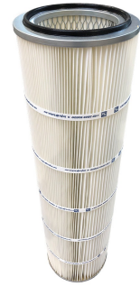
Filter cartridge, Type easy clean nano Product No.: 6161200315606