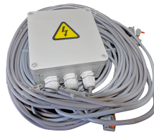
Master-Slave-Control 16A (incl. Transf. for 24V AC) Product No.: 15001001602