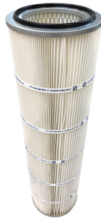
Filter cartridge, type easy clean plus Product No.: 6161200225308