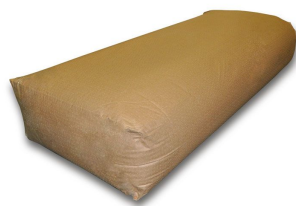
Cartridge protection NANNOX P50 Product No.: 68130010000