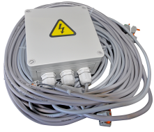
Master-Slave-Control 32A(incl. Transf. for 24V AC) Product No.: 150010032