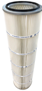
Filter cartridge, Type easy clean nano Product No.: 6161200325308