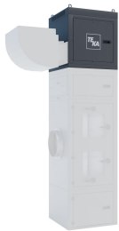
Option soundproof housing for FilterCube 4 Product No.: 950144194712