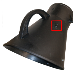
On/off switch via suction hood Product No.: 96313321