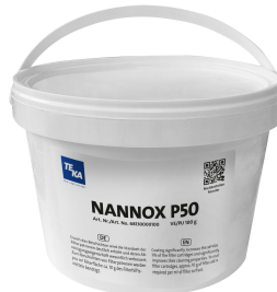
Cartridge protection NANNOX P50 Product No.: 68130000100