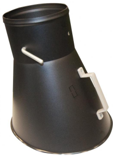
Exhaust ventilation hood Product No.: 104901