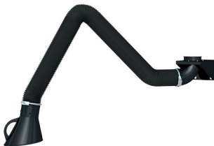
Suction arm, 4m, diam.150mm Product No.: 97603