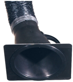
Adapter for extraction hood; diam.: 150 Product No.: 66210