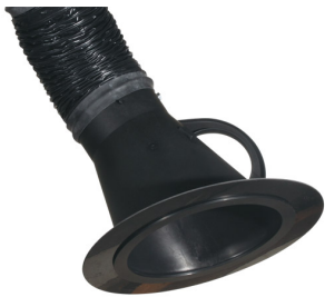
Adapter for extraction hood; diam 150 mm, Product No.: 66220