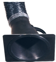
Adapter for extraction hood; diam.: 150 Product No.: 66210