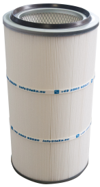
Filter cartridge, type standard, Product No.: 6160600110008