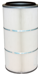
Filter cartridge, type easy clean plus Product No.: 6160600212508