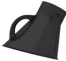
Exhaust ventilation hood diam. 150 mm Product No.: 66200