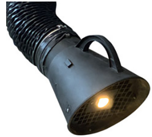
Lighting for 1 suction arm/crane Product No.: 96323