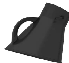
Exhaust ventilation hood diam. 150 mm Product No.: 66200