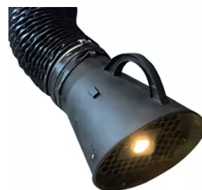
Lighting for 1 suction arm incl. hood Product No.: 96323