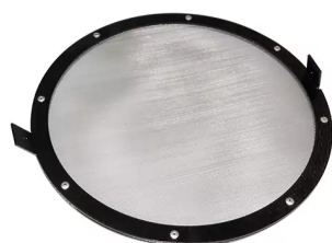
Protection grille (finely woven) for installation Product No.: 10372