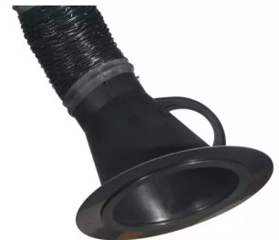
Adapter for extraction hood; diam 150 mm, Product No.: 66220