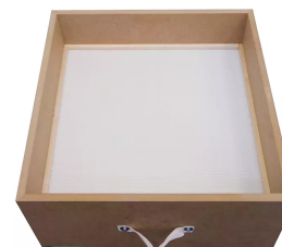
Filter cassette H13, filter surface: 14m 2 Product No.: 100357