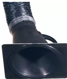
Adapter for extraction hood; diam.: 150 Product No.: 66210