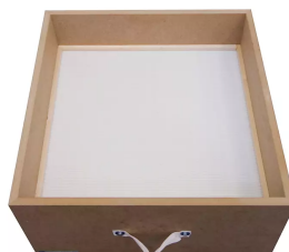
Hepa filter H13, 610 x 610 x 292mm Product No.: 10030