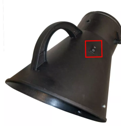
On/off switch via suction hood Product No.: 96313321