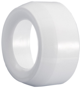
ALSIDENT Reducer 100 mm - 75 mm, white