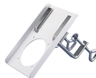
Table bracket, white Product No.: 27510