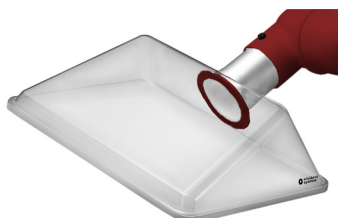
ALSIDENT Suction hood, DN 75, 420 x 320 mm Product No.: 17542324