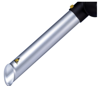
ALSIDENT pipe nozzle NW 50 (AS), antistatic, Product No.: 150316