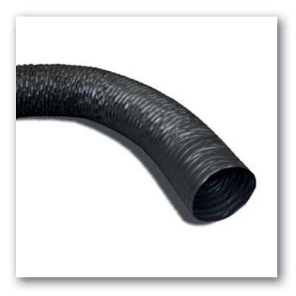
Exhaust air hose, Dia. 100 mm length: 6,0 metres