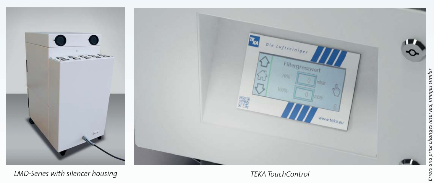
LMD-Series with silencer housing