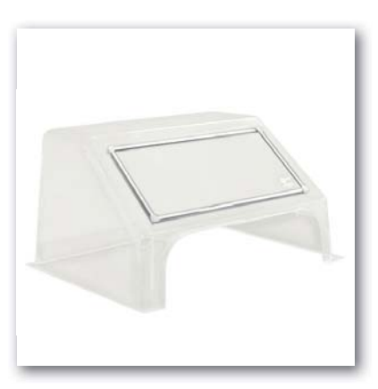
ALSIDENT suction cabinet type 2 white corners, without flange (WxDxH: 635 x 480 x 350 mm)