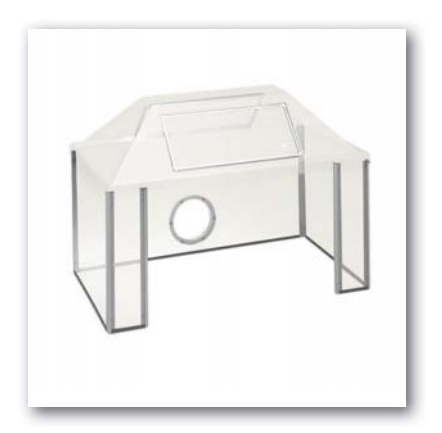
ALSIDENT suction cabinet type 1 medium, white corners, (WxDxH 1.000 x 600 x 710 mm), Side panels height 500 mm