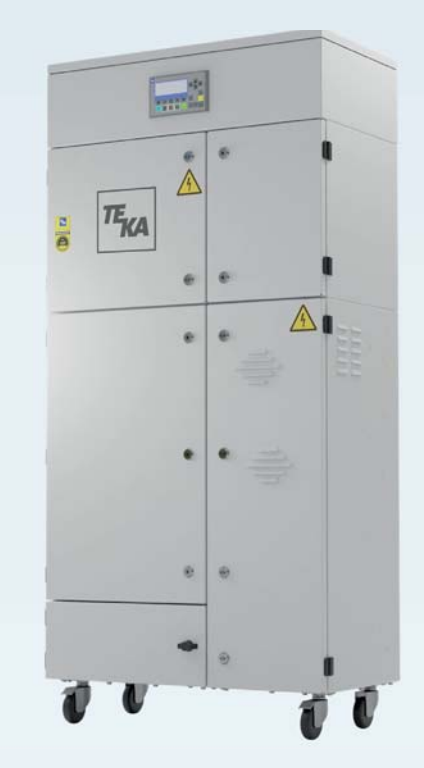
Filter cartridge unit LFE-series

The unit is equipped with an additional activated carbon filter to separate most of the gases. The unit is also equipped with a HEPA final filter stage. The monitoring of the final filter stage is carried out by means of an additional control lamp and via the SUB D9 interface. A great advantage of