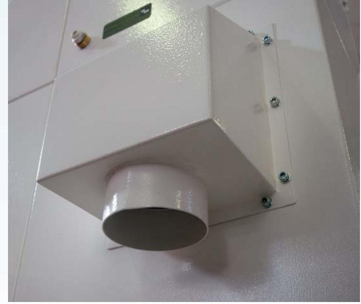
Intake housing version 3, 1 x dia. 100 mm