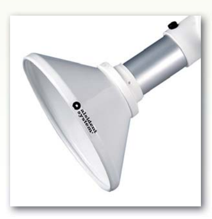
ALSIDENT suction hood round Dia. 50, d = 200 mm, white