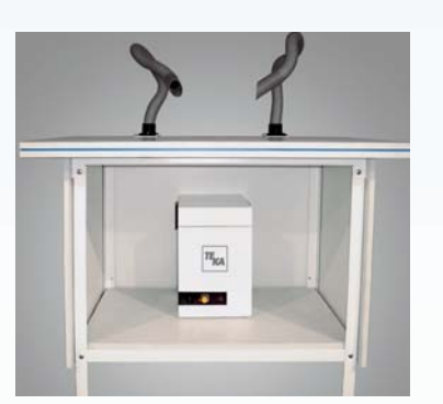
FilterCase Basic Set (Art. No. 97871)