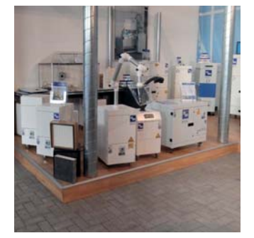
Laser Exhaust area in Weseke