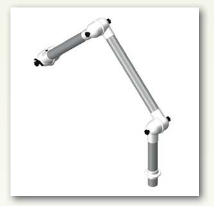
ALSIDENT suction arm Dia. 75 (AL) 830 mm, white, 3 joints, table mounting