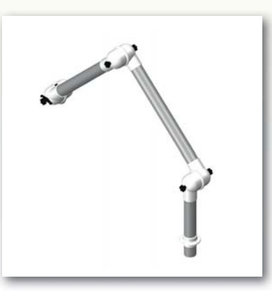
ALSIDENT suction arm dia. 50 (AL) 765 mm 3 white joints, complete for table mounting