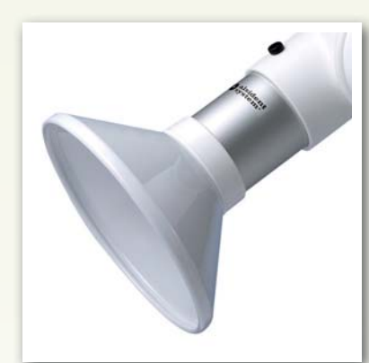
ALSIDENT suction hood round Dia. 75, d = 200 mm, white