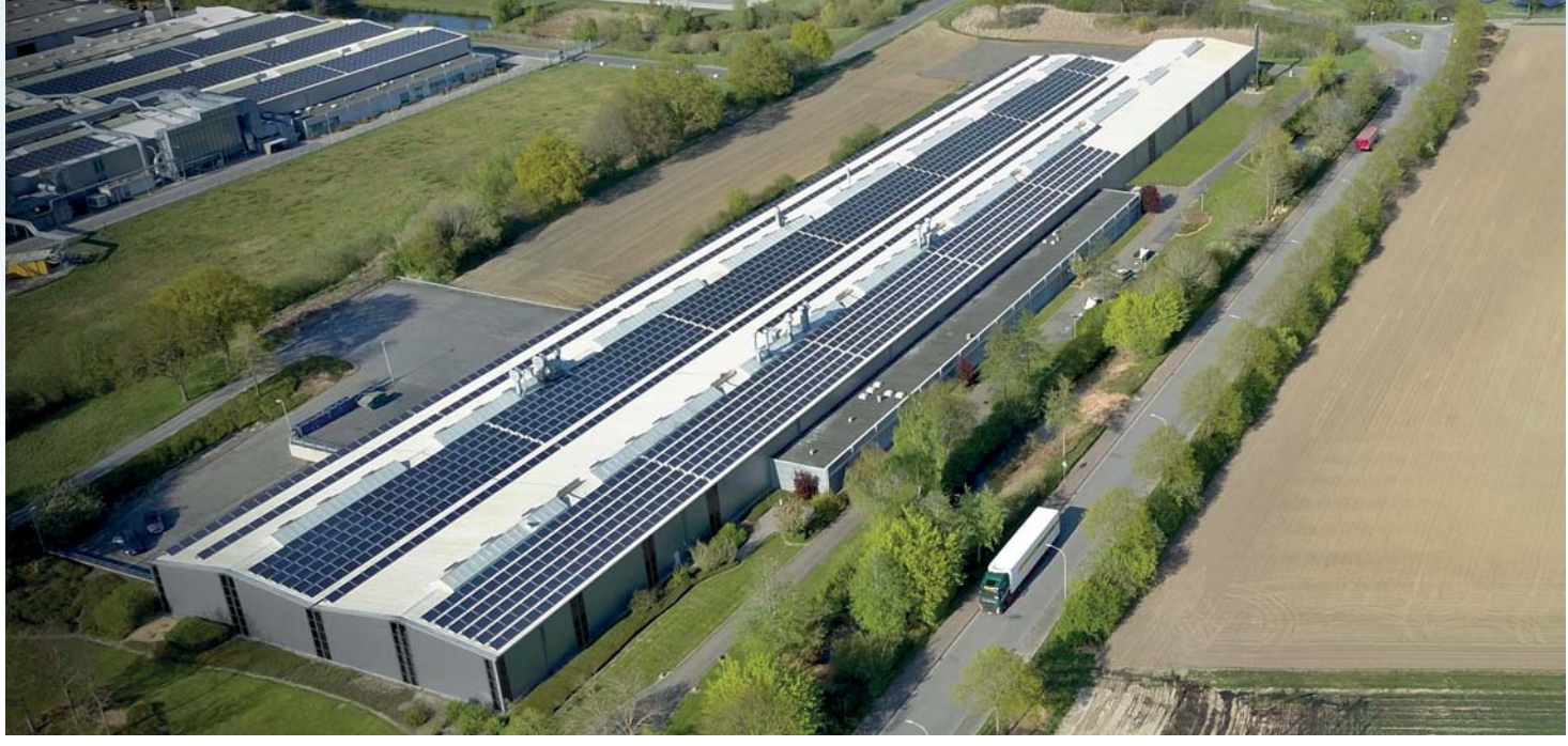
Communication centre in Weseke