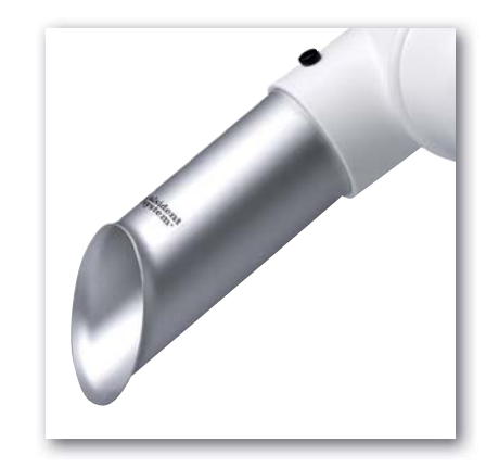
ALSIDENT Pipe nozzle Dia. 75, Length 250 mm