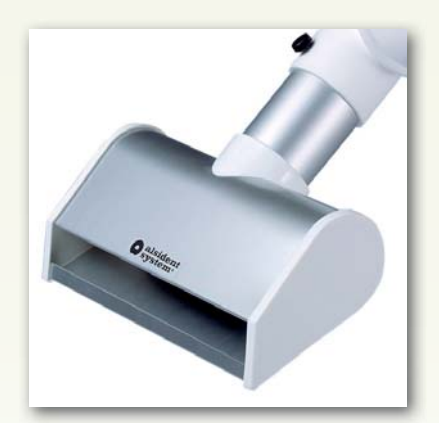
ALSIDENT slotted nozzle, Width 200 mm, white