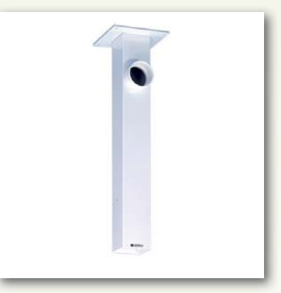
ALSIDENT Ceiling bracket Exhaust air lateral