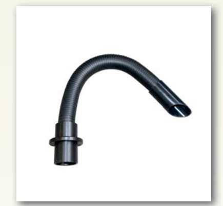
OPTIFLEX suction arm Dia. 50, 500 mm with pipe nozzle and mounting spigot