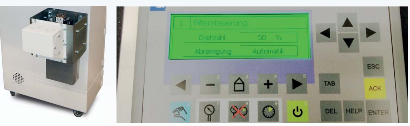
Rear view with optional Shut-off valve