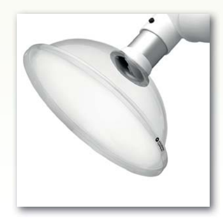
ALSIDENT suction hood round Dia. 100, d= 500 mm, white