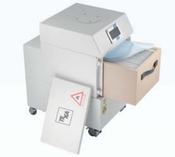
Filter equipment of the AirFilter Mini