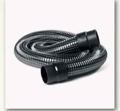
High vacuum hose with 2 nozzles Dia. 45 mm, 5,0 metres