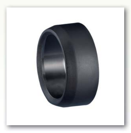
ALSIDENT Reducer sleeve 63 mm - 50 mm, black