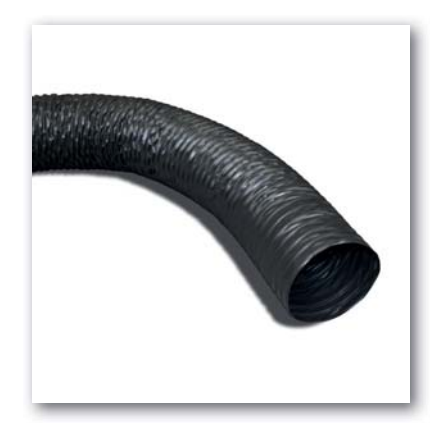
Exhaust air hose, NW 125 mm length: 6,0 metres