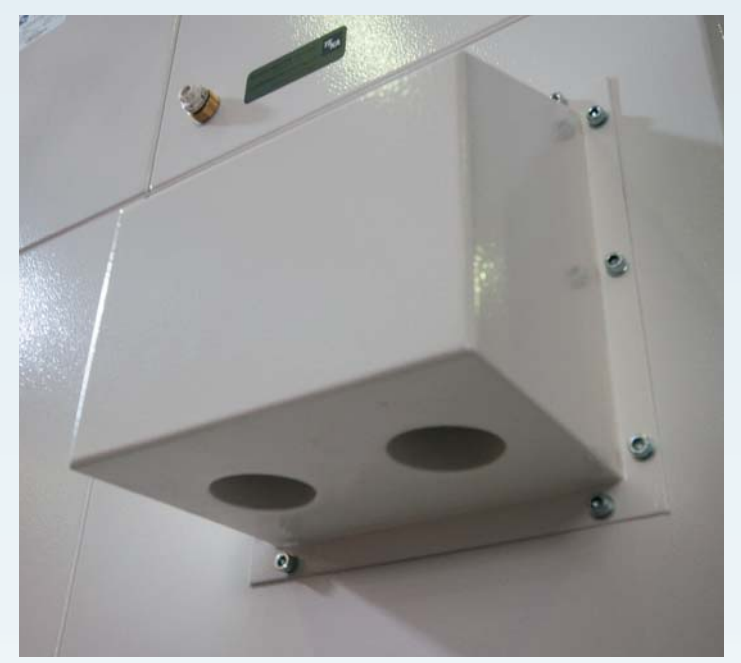
Intake housing version 1, 2 x dia. 50 mm