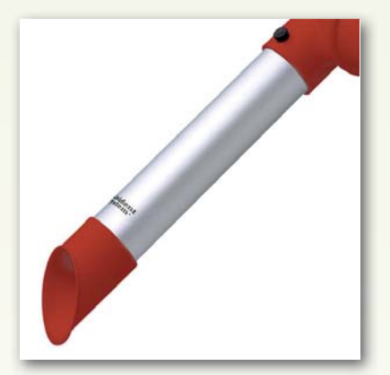
ALSIDENT Pipe nozzle Dia. 50, with red plastic head