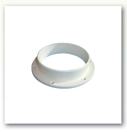
ALSIDENT Cabinet flange Dia. 50 mm, white