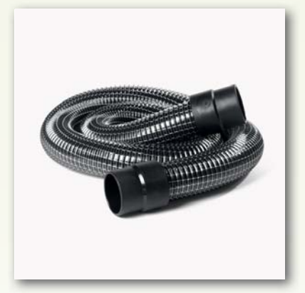
High vacuum hose with 2 nozzles Dia. 45 mm, 2,5 metres