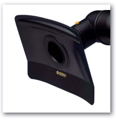
ALSIDENT suction hood flat, antistatic Dia. 75, 330 x 240 mm