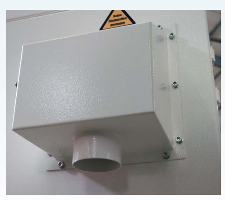
Intake housing version 2, 1 x dia. 71 mm