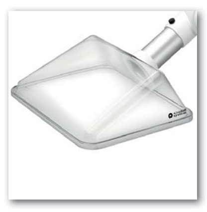
ALSIDENT Suction hood angular Dia. 50, 300x250mm,white