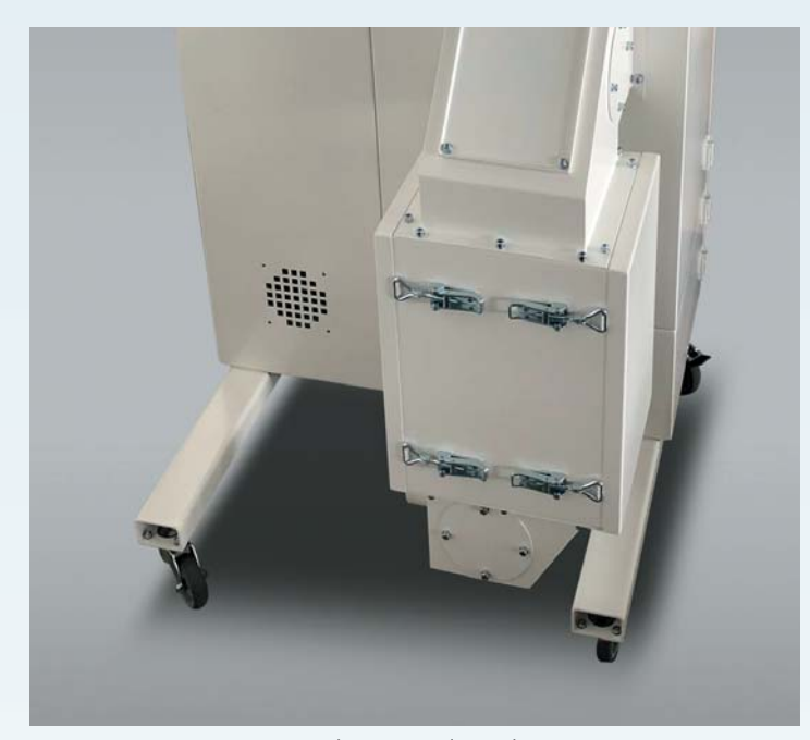
LFE with optional spark trap

An automatic filter monitoring indicates when a replacement of the filter is necessary. The particle sensor is automatically monitored, and on particle detection, an error message is displayed on the control display and the unit shuts off. Controlling the filter unit via a connected laser machine can be accomplished by means of the Harting interface. A 2.5m power cord with plug and inlet socket is included.