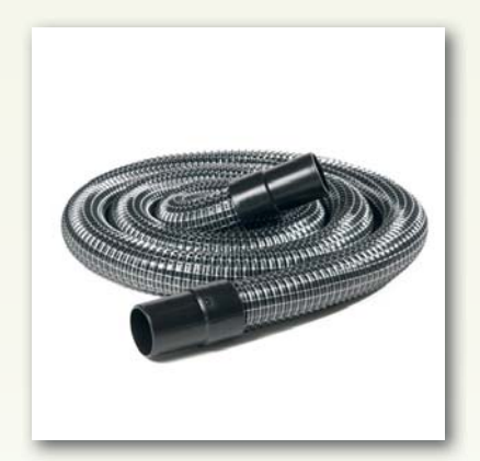
High vacuum hose with 2 nozzles Dia. 45 mm, 10 metres