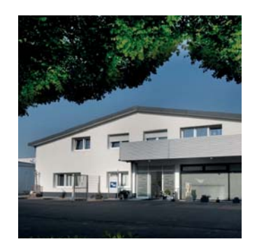
Training center in Weseke