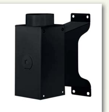
ALSIDENT wall mount, Dia. 75-50, mm black