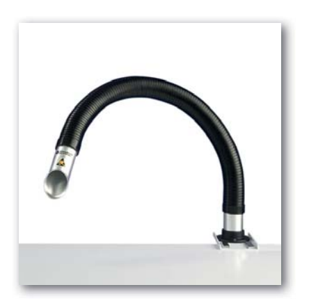
ALSIDENT suction arm Dia. 50, flexible, antistatic