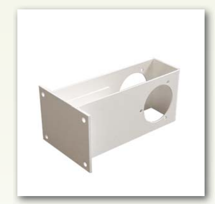
Wall bracket system 50 Optiflex system