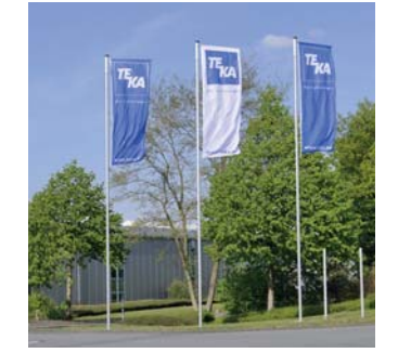
The flags are hoisted in Coesfeld