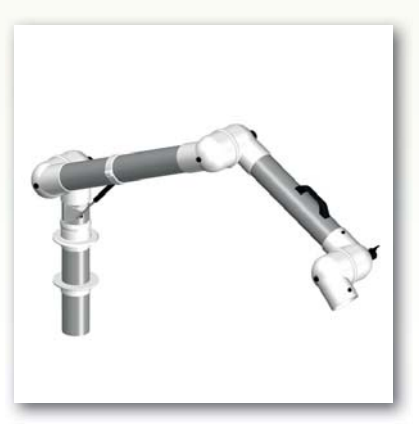
ALSIDENT suction arm dia. 100 (AL) 1370 mm, 3 white joints, white, table mount