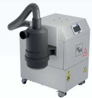
Optional: Refine pre-filter unit