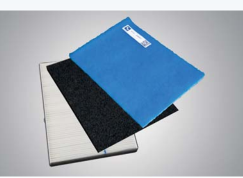
FilterCase Basic Filter set