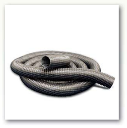
High vacuum hose Dia. 100 length: 2,5 metres