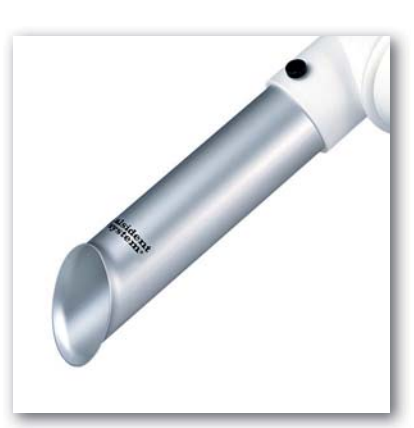
ALSIDENT Pipe nozzle Dia. 50, length 210 mm